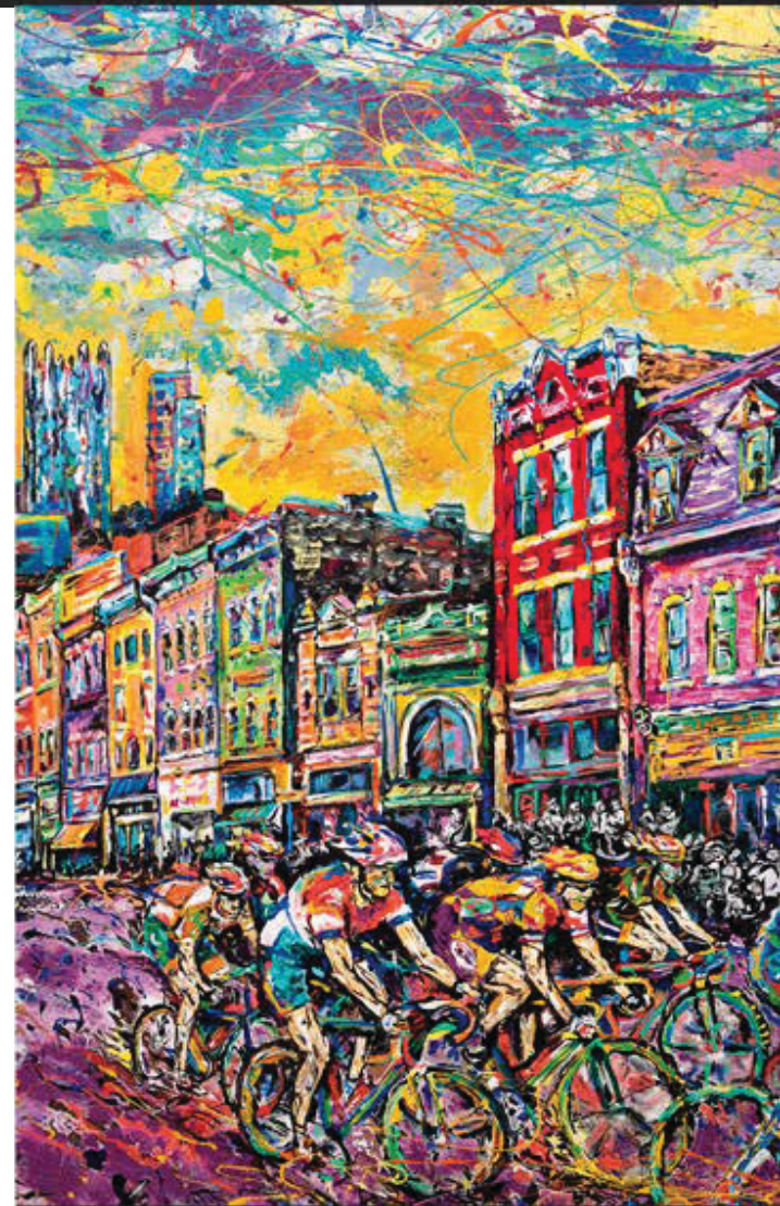
"COLORS OF CARSON STREET" BY JOHN PRASCA JOHNOSART.COM

South Side Chamber of Commerce PO Box 42345 Pittsburgh, PA 15203-1141